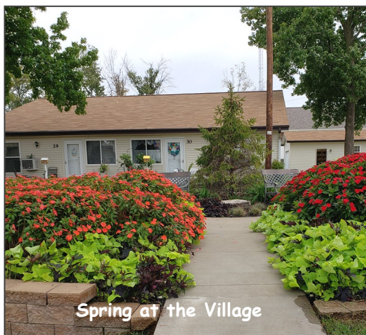
Spring at the Village

Our mission, from our founding in 1973 to the present time, is to provide low-income seniors with affordable housing facilities which will allow them to live independently for as long as possible.