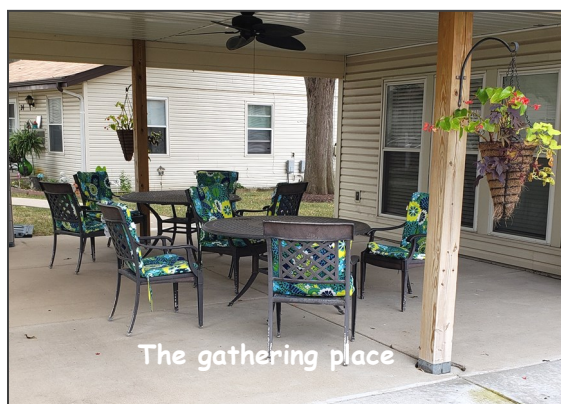
The gathering place

As a not for profit corporation, having no affiliation with any government agency, we strive to promote a healthy, secure, happy and safe environment for all our residents. A nine-member volunteer Board oversees the daily management of the facility. Our complex is well known in the area for its beauty, low cost, well-kept grounds, friendly, home-like atmosphere, and central location in St. Peters, MO.