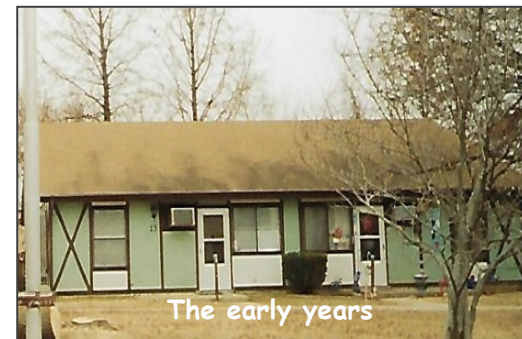
The early years

As a not for profit corporation, having no affiliation with any government agency, we strive to promote a healthy, secure, happy and safe environment for all our residents. A nine-member volunteer Board oversees the daily management of the facility. Our complex is well known in the area for its beauty, low cost, well-kept grounds, friendly, home-like atmosphere, and central location in St. Peters, MO.